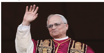
POPE LEO XIV 8 MAY 2025

Home is where the heart is. Divine Love desires nothing more than to dwell in the home of your heart.